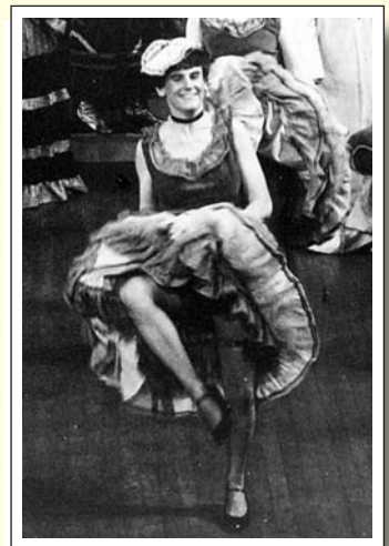
La Vie Parisienne 1980