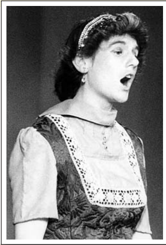
The Gipsy Baron 1979